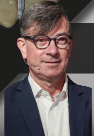
Odt. Carlo Borromeo